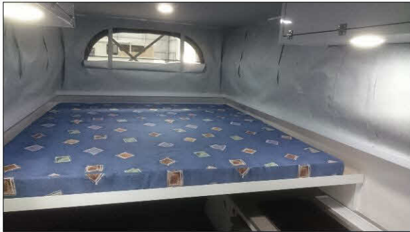
North South bed + bed side storage cabinet on both sides.