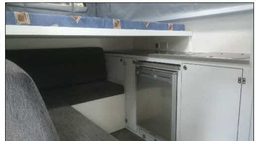
Kitchen—has lots of storage cabinet space, 80l fridge and a great 3 burner stove and sink.