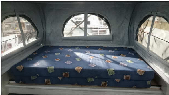
North South bed + bed side storage cabinet on both sides.